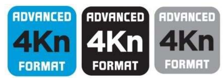
Figure 5 Advanced Format native logos