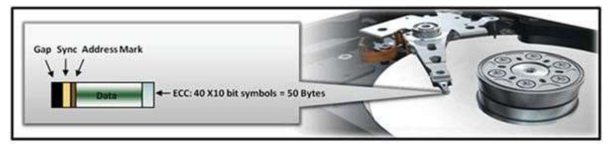
Figure 1 Legacy sector format

The legacy sector format contains a Gap section, a Sync section, an Address Mark section, a Data section and Error Correction Code (ECC) section as shown in Figure 1.